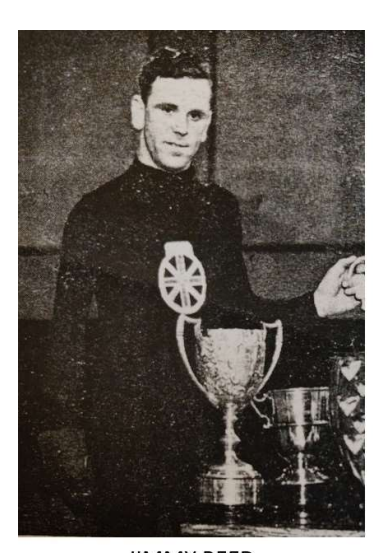
JIMMY REED 1937