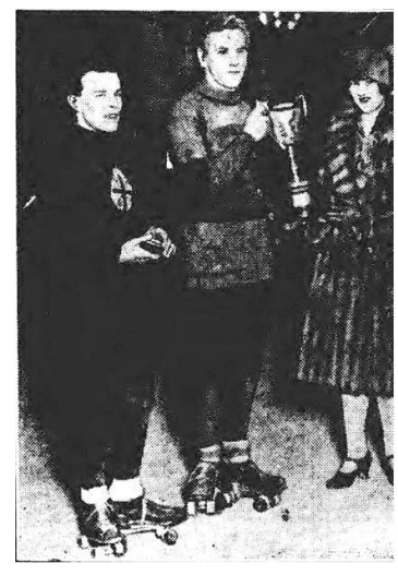
JIMMY REED 1929