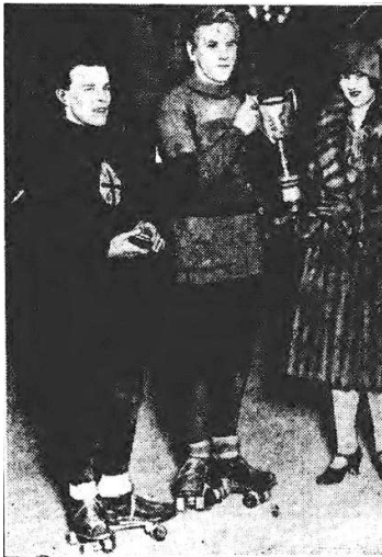
JIMMY REED 1929