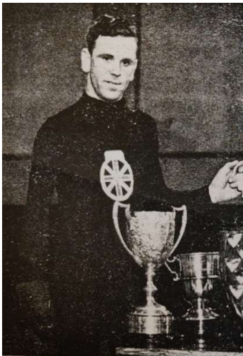
JIMMY REED 1937